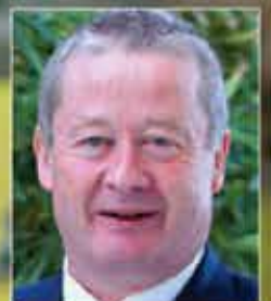
20 YEARS IN THE MAKING PAGE 12