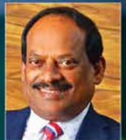
HEART OF NSBM PAGE 01