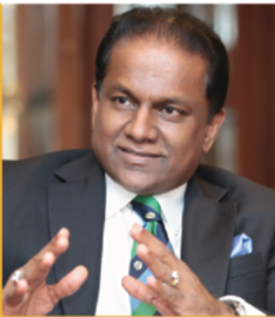
HON. THILANGA SUMATHIPALA MEMBER OF PARLIAMENT